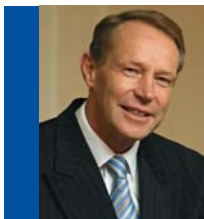
Paul Hutchison Your Electorate MP