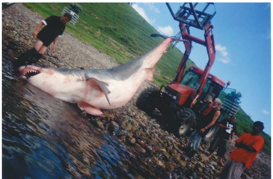
It didn't sink in what we had done until I saw the size of the teeth and mouth!

“At first I thought what the f*** have we got here when all I saw was this huge big dark shape coming up from the bottom. It was so bloody big I thought it was the Orca that we saw a couple of days earlier, but then an Orca could bust out of that in an instant. The boat started to list really badly now and holy cr** the only thing I had running through my head was the theme song of Jaws and the scene where this huge Noah was chomping through the stern of his boat... and I can’t tell you what I said next when its head popped out of the water and I saw what it was as you couldn’t print it! OH... MY... GAWD!!! I had never ever seen such a big mother. It’s just as big as the boat! Is it dead? Alive? Half alive?”