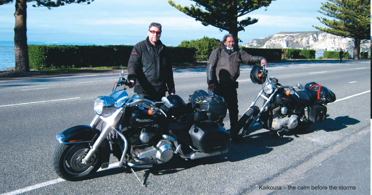
Kaikoura – the calm before the storms