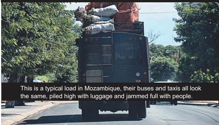
This is a typical load in Mozambique, their buses and taxis all look the same, piled high with luggage and jammed full with people.