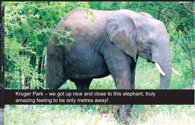
Kruger Park – we got up nice and close to this elephant, truly amazing feeling to be only metres away!