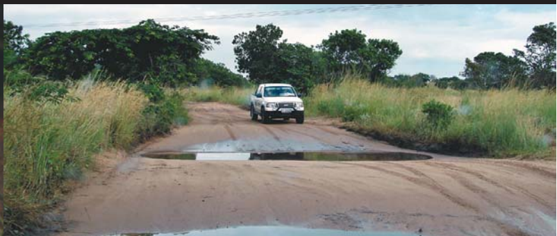
We travelled a lot of sand roads in Mozambique. This would be about the best sand road we travelled on, and we often found ourselves lost, with the majority of roads in worse condition than our farm tracks, although Rod did have some fun in our 4x4 hire vehicle. Mozambique is a MUST to visit, amazing place!