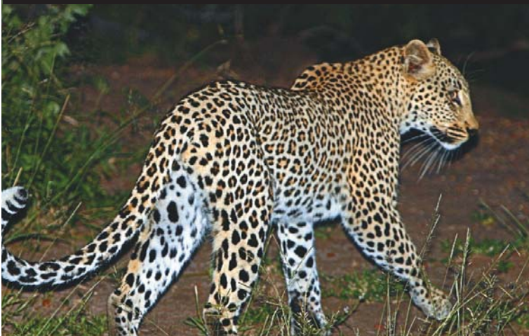
Another lucky viewing on our night drive. This leopard was hunting waterbuck so we were able to watch it for about 10mins before it walked down right beside the truck we were in and disappeared!