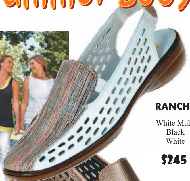
RANCHI White Multi Black White $245