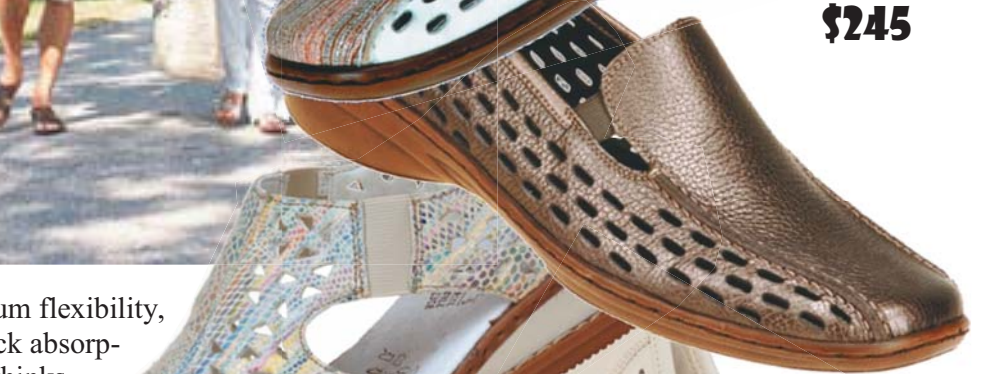
RIBBLE Also White $245