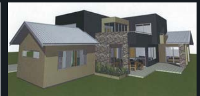
Drafts of our new display home in Karaka