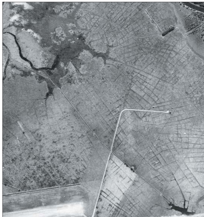
Part of the extensive network of drains bordering the Awanui River, photographed during a survey by the NZ Government in 1944