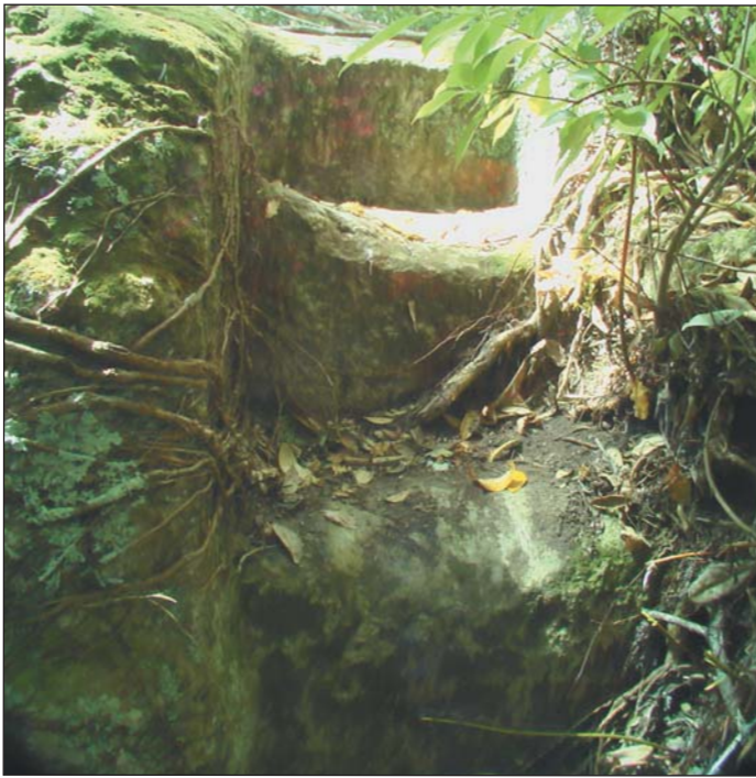
It would have taken thousands of feet over aeons to wear down these ancient NZ stone steps.

EDITOR: This concludes the current series of New Zealand History Under Siege. The series will resume later in the year with in-depth investigation into the peoples Maori found when they arrived in NZ, revealing startling new evidence about the tiny Turehu people. PLUS Poukawa: Our most shameful archaeological coverup.