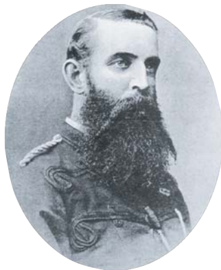
Captain Gilbert Mair

whereas if they accepted the money I had brought, it would henceforth be called Kainga-poto, (the quickly disappearing wealth). This saying of mine has since become a proverb for all large sales in the Bay of Plenty... I strongly urged them to make adequate reserves, and eventually, 1700 acres and three small totara bushes were cut out, and it's on one of these that the carved house and largest village now stand..."